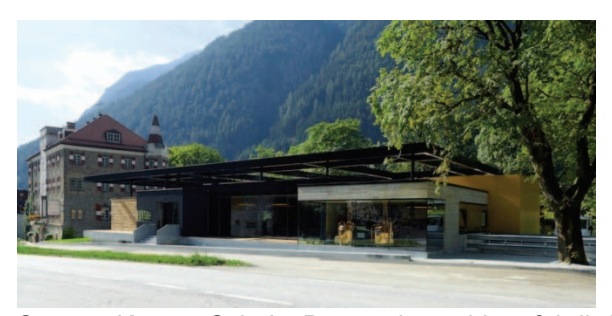
Figure 1: Andreas-Hofer-Bräu brewpub in Franzensfeste, Italy