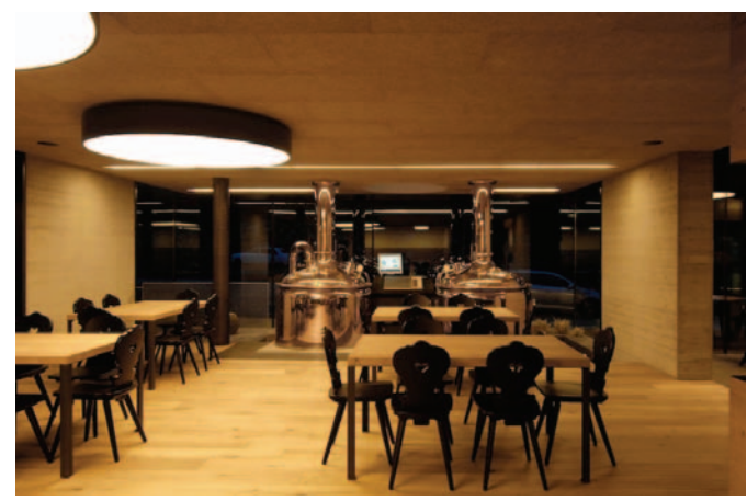
Figure 2: Interior of the Andreas-Hofer-Bräu brewpub