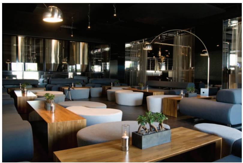
Figure 6: Sofa lounge at Brasserie de Monaco (MC)