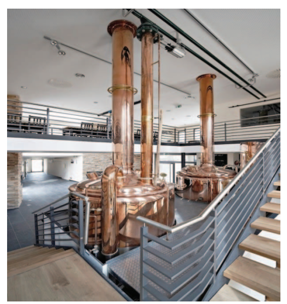
Figure 4: Brewhouse at the Brauhaus Goldener Engel